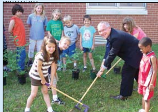
Mullica Township's Garden Technology Program, 2008 Grant Winner

Visit us at www.nj-teachers.com to see our growing list of over 50 participating NJ schools, districts and education organizations.